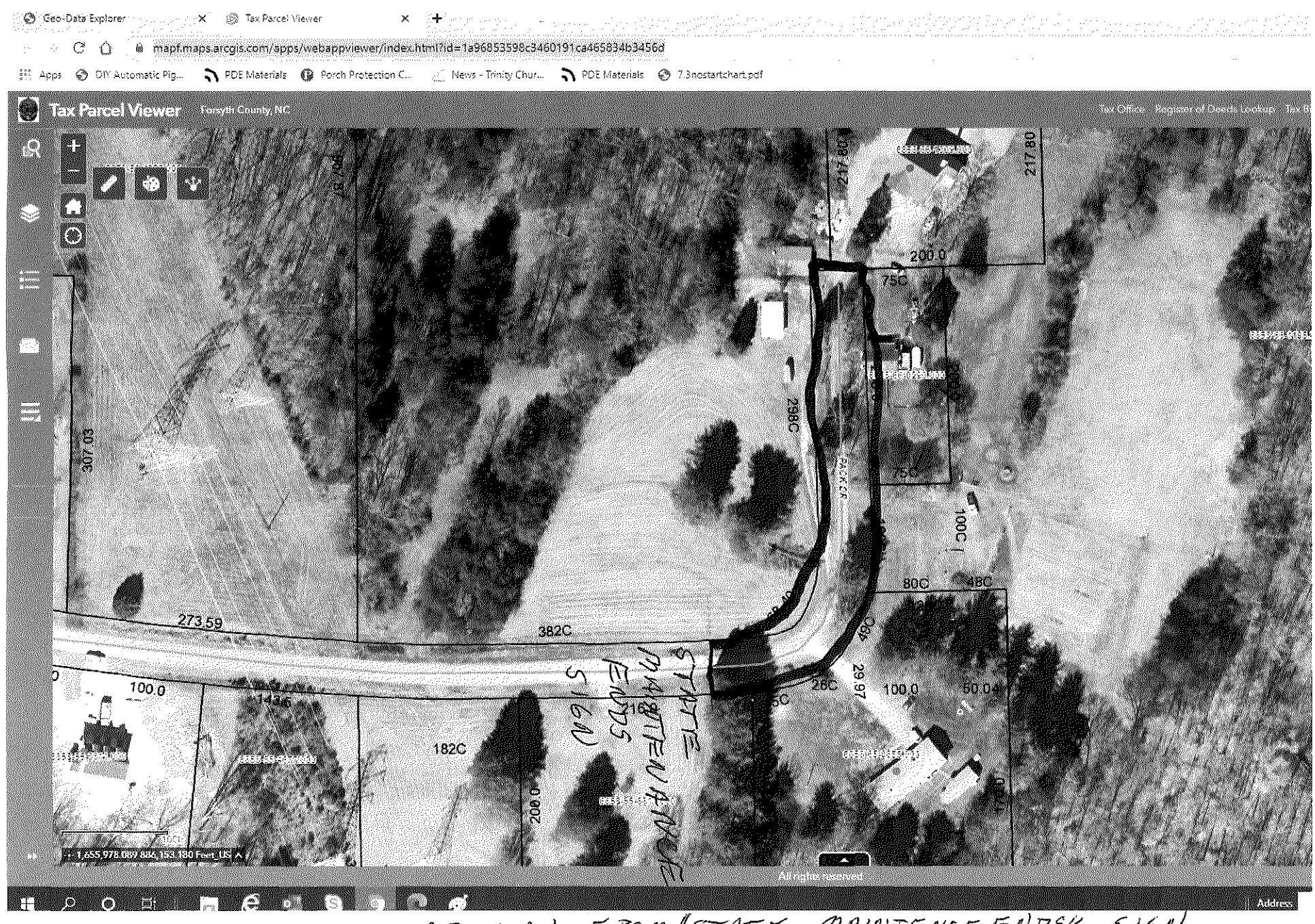
ABANDON FROM STATE MAINTENCE ENDSU 516N TO THE END OF PACK DRIVE AT 5950 THIS WILL CHANGE TO 25' PRIVATE EASEMENT